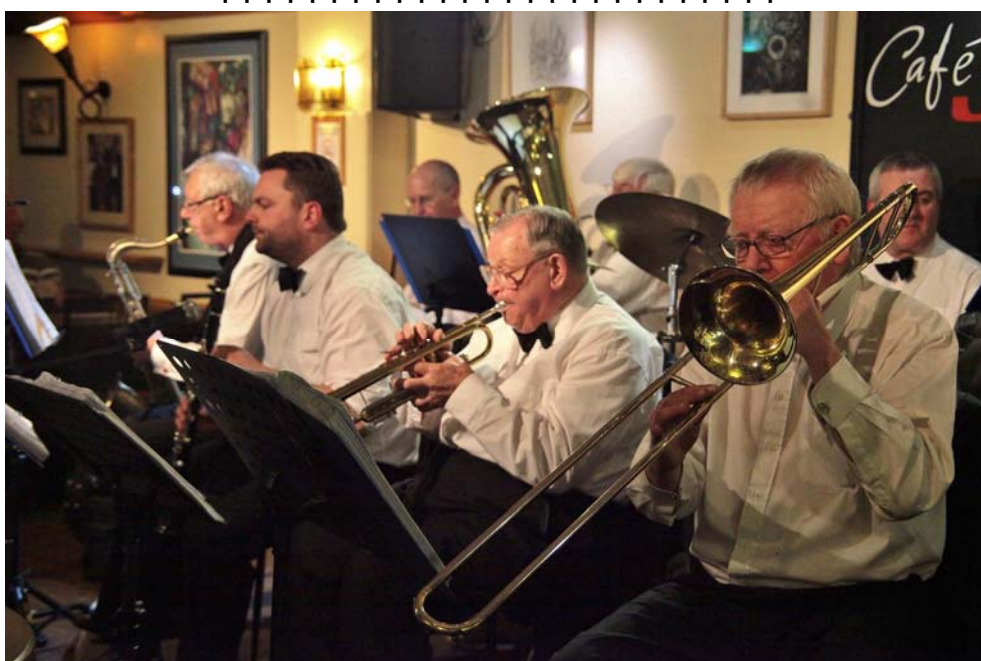
All that Jazz 12 th May

Visit the PJS Website :- www.pjscardiff.co.uk