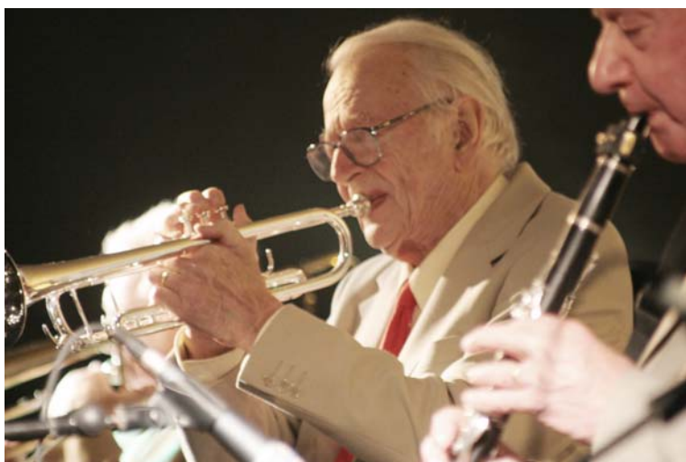
Humph at Pontypool