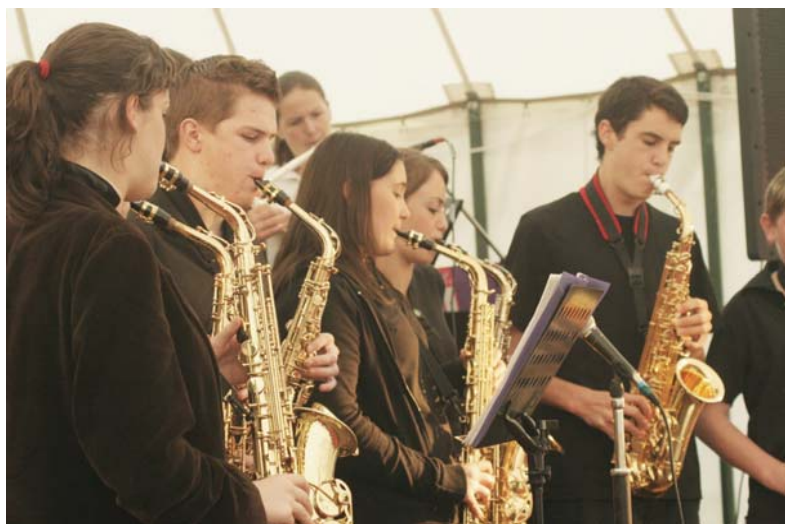
"Kool Cats" from Abergavenny

Page 4