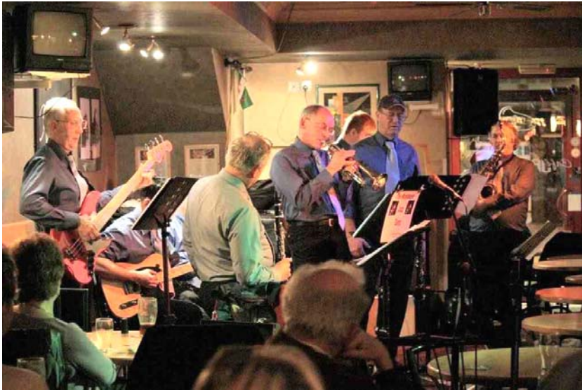
The Workhouse Band