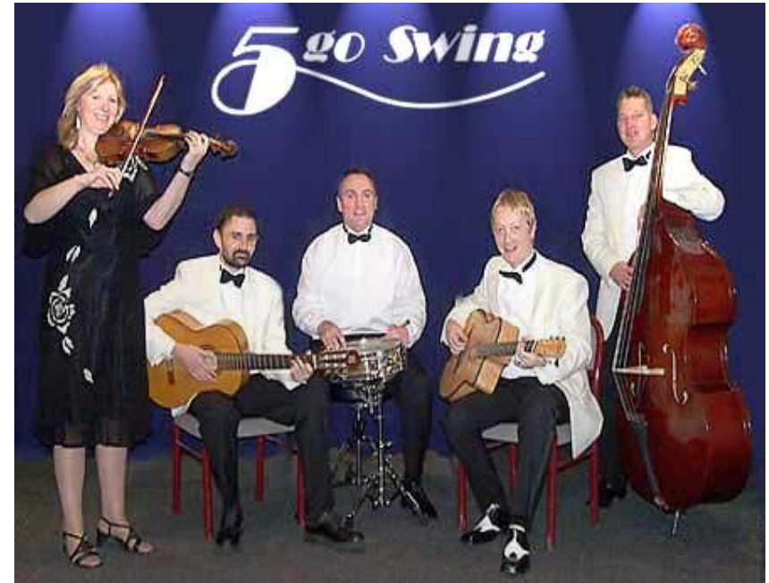
5 Go Swing "Gypsy Jazz" style music