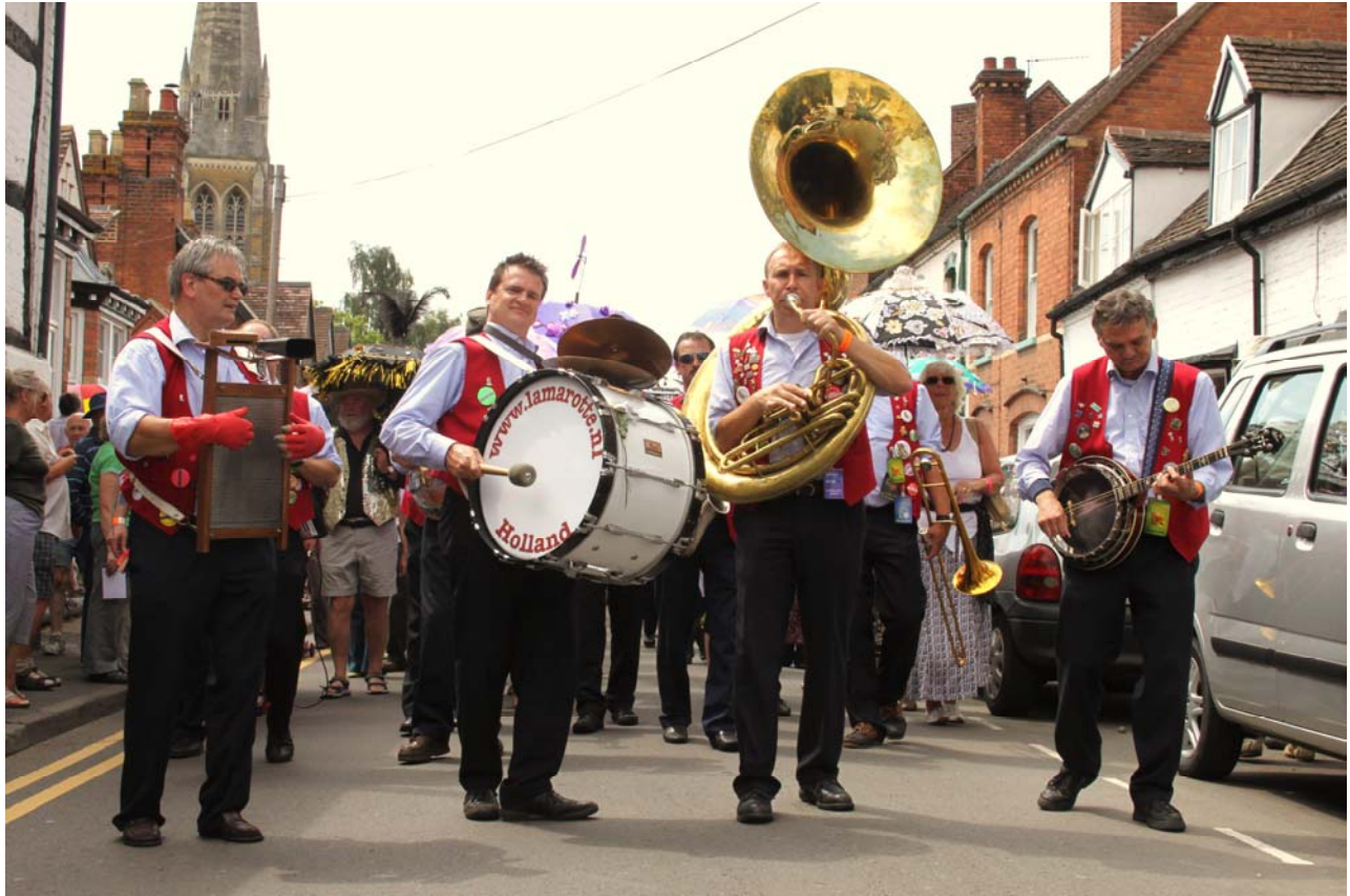
“Lamarotte” leading the festival parade