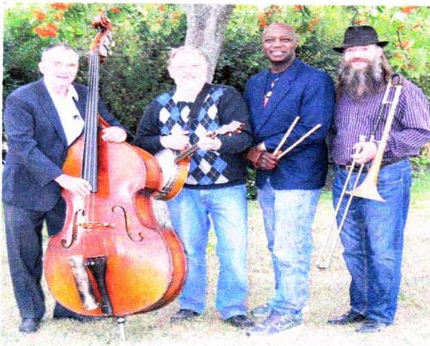
The Great Danes